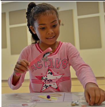
Student gets excited about magnets during a Day of Science with Bayer employees.

Wonder, inspiration and discovery are blossoming in local elementary classrooms because of seeds you helped us to plant throughout this school year!