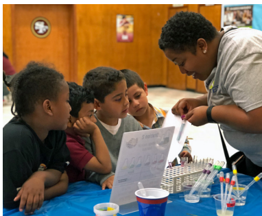
Students at Allendale Elementary enjoy a special Day of Science Science Super Star prize! Allendale is one of several OUSD schools getting a special Day of Science event.

This teacher is one of 76 educators in Oakland, Berkeley, Richmond, and other East Bay communities recognized by CRS this Spring for excellence in elementary science teaching. An impressive 38 of these teachers earned the highest recognition as Trailblazers in Elementary Science Teaching and Learning.