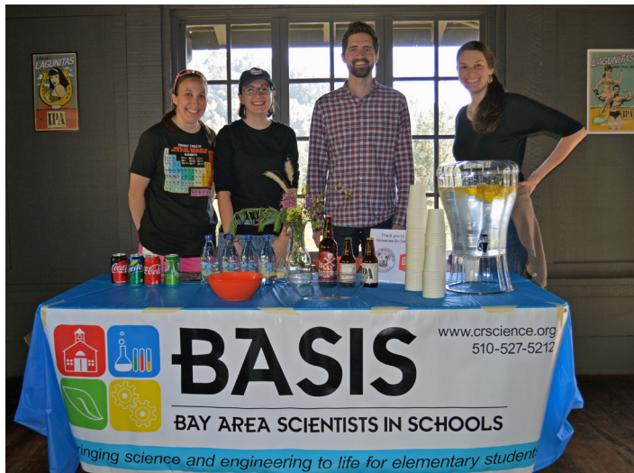
Thank you to our partners at the UC Botanical Garden for co-hosting our volunteer appreciation celebration in May. Docent-led tours of the amazing flora were a highlight of the event!

Arthur Rock Foundation Joseph and Vera Long Foundation Berkeley Public Schools Fund Encore Fellowships Network Bayer Dean and Margaret Lesher Foundation Dean Witter Foundation Walter & Elise Haas Fund Cisco Systems Foundation Clorox Company Foundation Irene S. Scully Family Foundation Clif Bar Family Foundation East Bay Community Foundation Grifols Mary A. Crocker Trust Richmond Community Foundation UC Berkeley College of Chemistry UC Berkeley Chancellor's Community Partnership Fund VWR Foundation Wareham Development In Dulci Jubilo, Inc. Joseph and Mercedes McMicking Foundation Neda Nobari Foundation Port of Oakland Goggio Family Foundation The Lowell Berry Foundation Bernard E. and Alba Witkin Charitable Foundation Kinder Morgan Foundation Oakland / Berkeley Association of Realtors Arduro Biotech Associated Students University of California PG&E Seyfarth Shaw Charitable Foundation