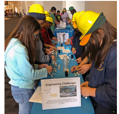
Students build structures wearing Port of Oakland hard hats at the Oakland A's Science of Baseball Education Day.

Whether it's a new team of graduate students in a Cal research lab, or employees of a local company, CRS helps scientists and engineers develop fun, engaging lessons that highlight the science they are most passionate about sharing.