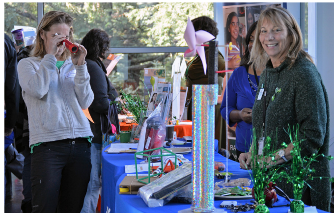
A teacher learns about science resources for her classroom at the science resource fair at Chabot Space and Science Center.

This year's event was held in March, part of our Field Trip for Teachers series. We welcomed teachers from around the Bay Area to explore the museum and to meet with representatives