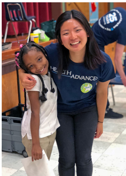
An excited student asked a scientist for her autograph after a lesson.

• Seeing "real world" applications of science in daily life Another surprising theme that also emerged was the need to counter a fear of failure, and to address negative stereotypes and discouraging experiences that might have planted seeds of doubt.