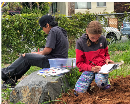
Students sketch observations in science notebooks.

scientific sketching activity. For some lessons, students drew maps, studying the landscape and available routes to predict where they might search for the next Tyrannosaurus Rex fossil. Some lessons looked at the variation within leaves found on the schoolyard to gain an understanding of local plant adaptations. And other lessons brought the students outside with their science notebooks to observe and discover the variety of living organisms right outside their classroom door.