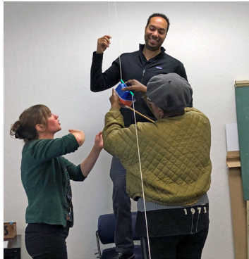
Port of Oakland employees are trained on a transportation engineering lesson.

To help Port of Oakland employees give elementary students a glimpse into aspects of Port operations, CRS teamed up with Port representatives to develop new classroom lessons and outreach demonstrations on topics like buoyancy, cargo handling, and transportation.